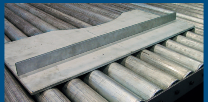
FlatMaster® 180 – Unparalleled power for thick plates and parts.